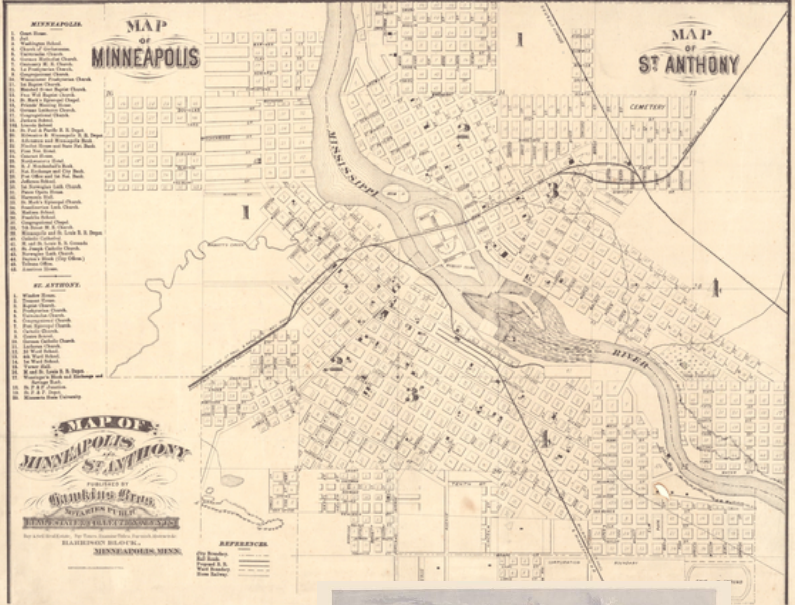
A vintage 1869 Map of St. Anthony and Minneapolis