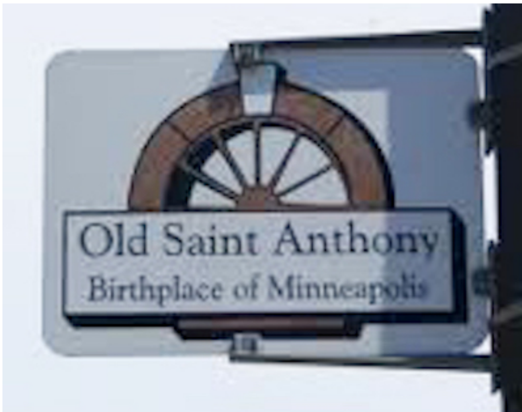
Light pole banner & street sign from the 1980-1990's "Old St. Anthony" period. The last of these signs were removed in 2021.